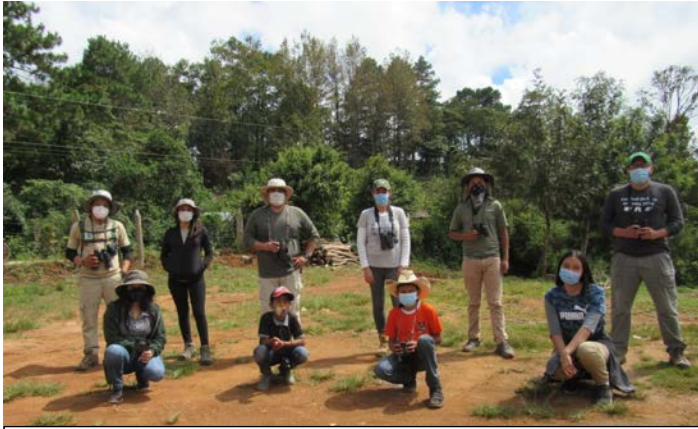
Jilgueros Birding Club in Marcala participated in the October 17 Big Day of Birding 2020