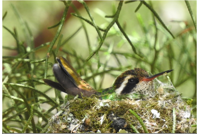
A female white-eared hummingbird on nest