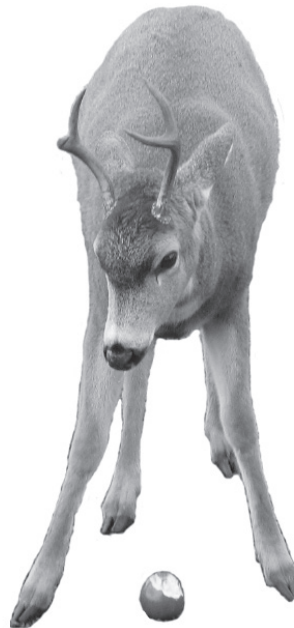
Northern white-tailed deer

The Nature Conservancy is seeking volunteers who live in the Altoona/ Hollidaysburg area to frequently visit the Brush Mountain Preserve to check on the newly constructed deer exclosure fencing, currently located in three separate areas (northwestern, southeastern and southern corners of the preserve). This project is critical in our efforts to restore the