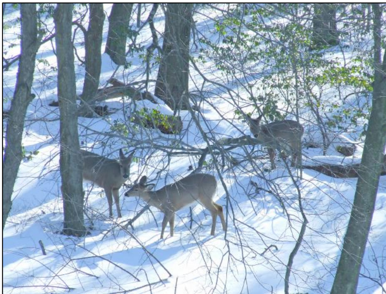
White-tailed deer in Plummer's Hollow

During the first 24 hours it is attached, it is harmless. But later, when it is full, it takes water from your blood into its gut and spits it back into you, which is when it can transmit Lyme disease or two other diseases: babesiosis and anaplasmosis. The parasite Theileria microti causes babesiosis, and Anaplasma phagocytophilum causes anaplasmosis. As many as 2 to 12% of Lyme disease patients will have anaplasmosis and 2 to 40% babesiosis. This complicates the diagnosis and treatment sometimes because the tick might